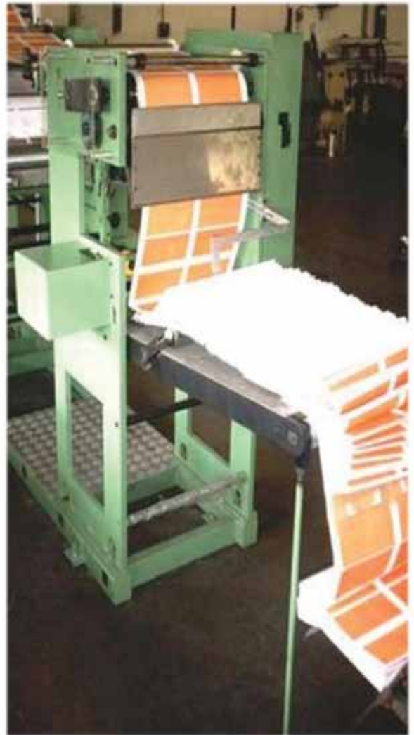
Folding or Rewinder option are available