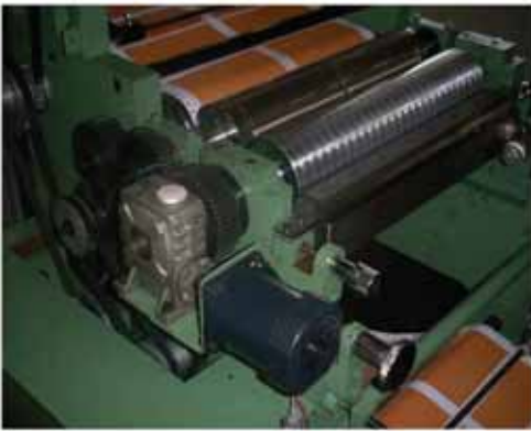
Flexo coating System

A compact design for the coating of Pressure Seal forms using 2 flexo coating system with individual dryers.