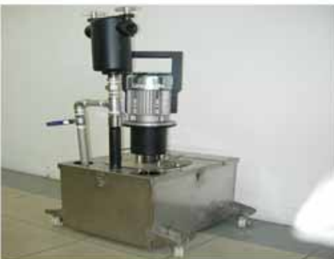
Ink is recirculated by Graymills Pump Filter System