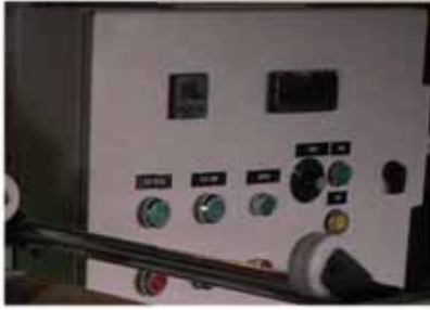
PLC control speed and heating elements.